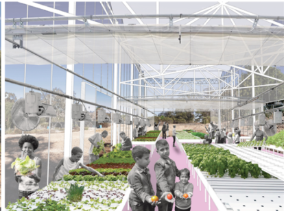
3 Hydroponics Station