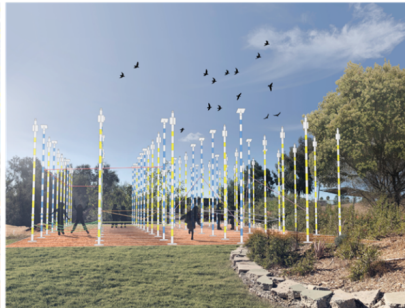
2 Energy Garden